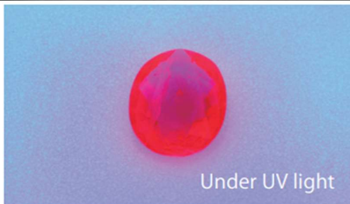
Under UV light