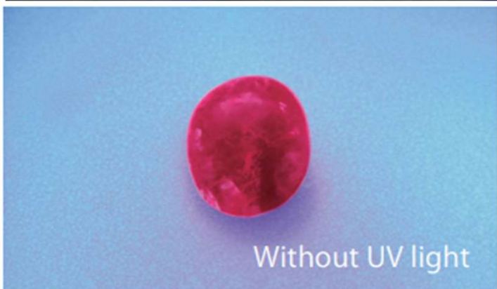
Without UV light