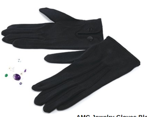
AMC Jewelry Gloves Black