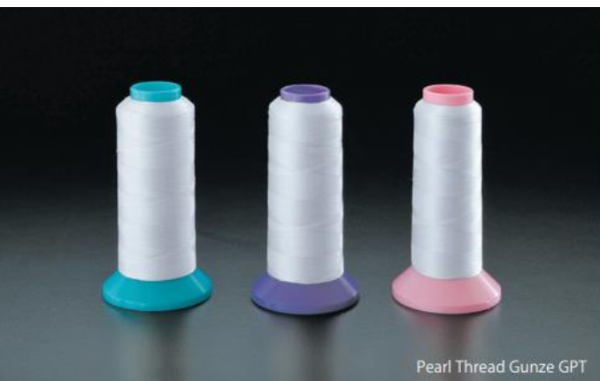
Pearl Thread Gunze GPT

More expensive than other threads, but has high-cost performance and is very popular for high-end Pearl and jewelry manufacturers.