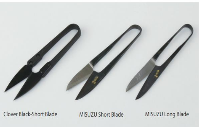
Clover Black-Short Blade