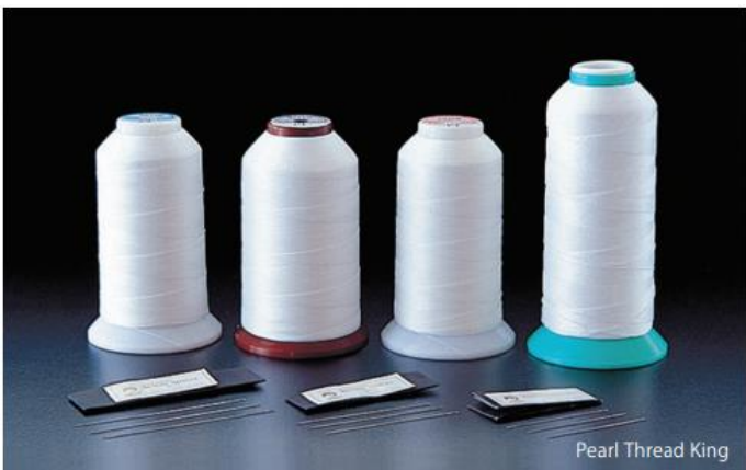
Pearl Thread King

In addition, since it is moderately stretchable, it is easy to process, and compared to silk thread, it is very strong and difficult to break, making it an easy-to-use material.