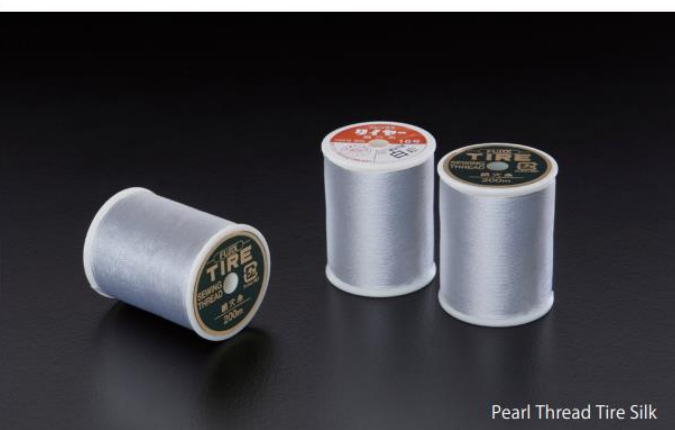
Pearl Thread Tire Silk

However, silk thread is a very delicate material, so there is a disadvantage that the thread needs to be changed regularly because it stretches and breaks in a relatively short period of time.