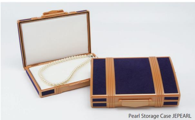
Pearl Storage Case JEPEARL