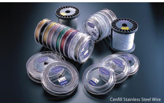
Cenfyll Stainless Steel Wire