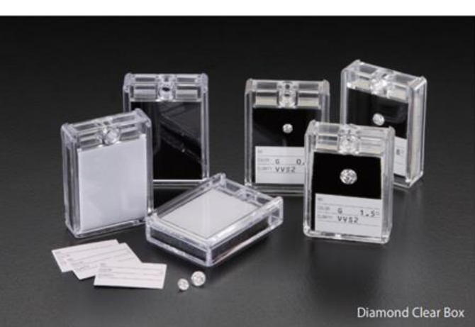
Diamond Clear Box