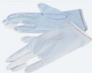
Toraysee MF Gloves