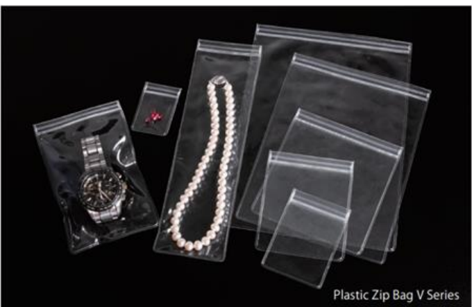
Plastic Zip Bag V Series