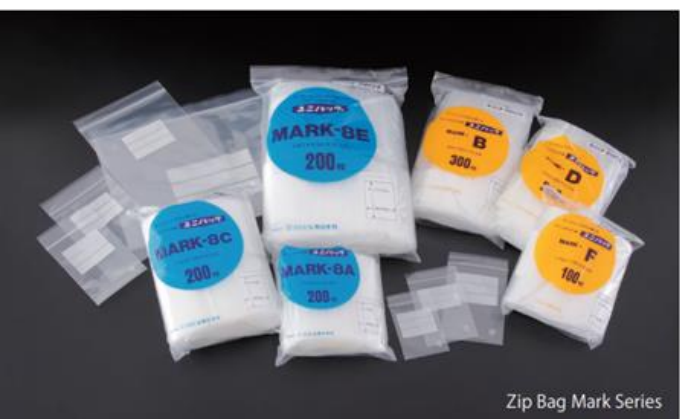
Zip Bag Mark Series