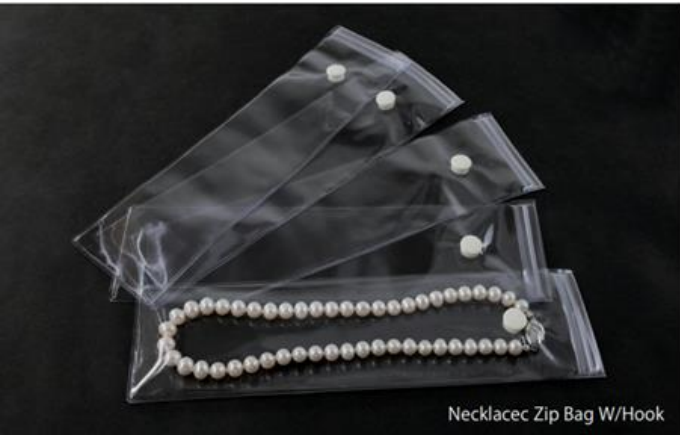
Necklace Zip Bag W/Hook