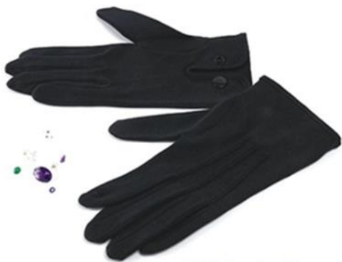
AMC Jewelry Gloves Black

Ideal for handling jewelry, watches, bags, and other valuables. No fingerprints, fat, or dirt will get on your valuable items.