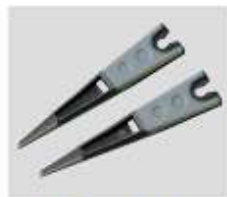
Replacement tip (401-063)