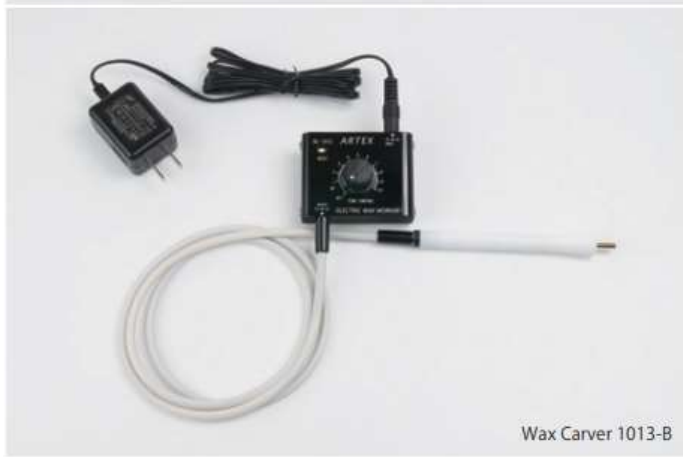
Wax Carver 1013-B