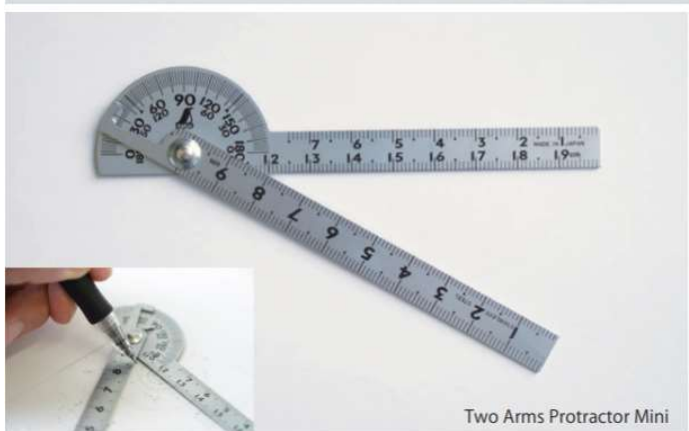
Two Arms Protractor Mini