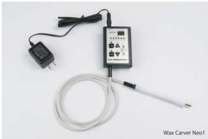
Wax Carver Neo1

This is the most important tool for wax carving. It can be used as a tool to modify the wax in case it cracks during the process, and it is also useful when creating sculptural designs. If you don't have a wax pen, you need to use an alcohol lamp to heat up a spatula and use the warmed spatula to modify. Once you know the efficiency and ease of use of wax carving pens, you will never go back to alcohol lamps.