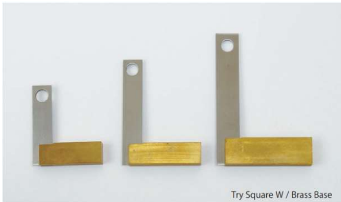
Try Square W / Brass Base

Once you have determined the width for your design, measure it with a ruler and use a spring compass to make a draft line around the wax. Begin the carving process by sawing off a slice of wax in the right thickness. We take care to make sure the sides are flat and parallel. For making sure these, Protractor & Try Square are very useful tools.