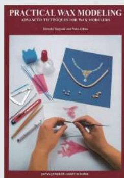
Practical Wax Modeling