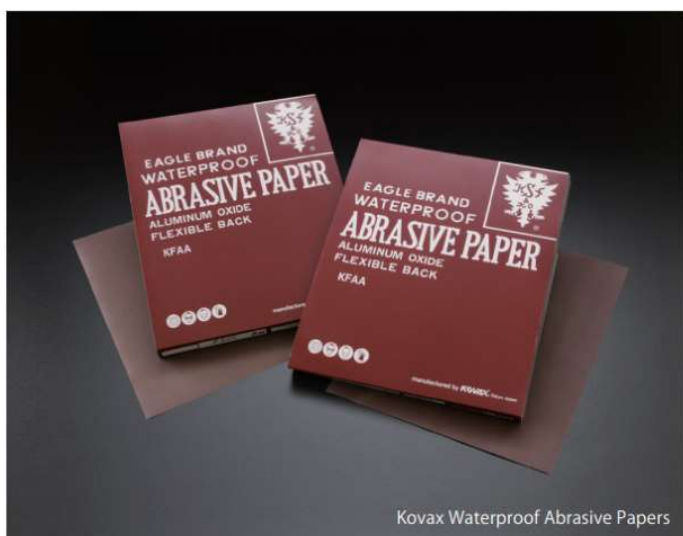
Kovax Waterproof Abrasive Papers

Use a water-resistant paper of #1000 and polish it with water to get a smooth surface.