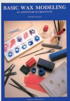
Basic Wax Modeling