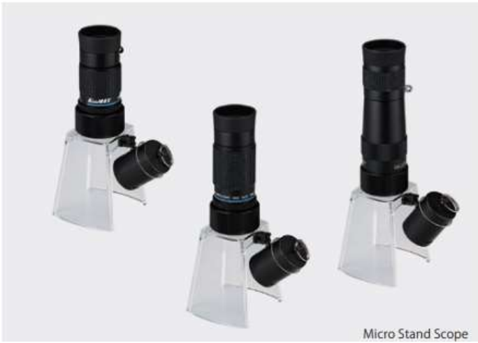
Micro Stand Scope