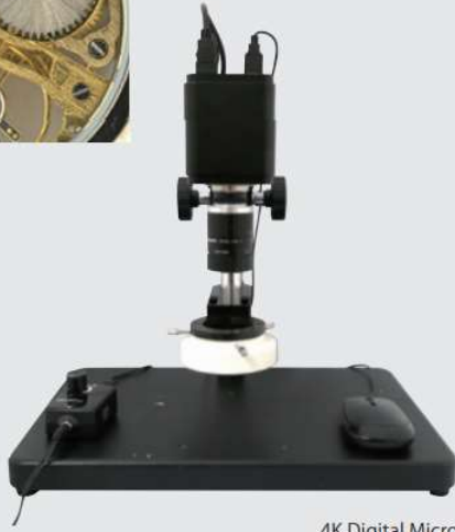
4K Digital Microscope System