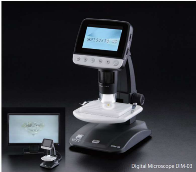
Digital Microscope DIM-03