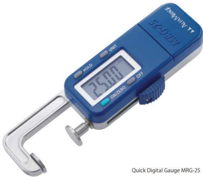
Quick Digital Gauge MRG-25