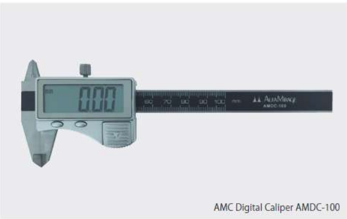
AMC Digital Caliper AMDC-100