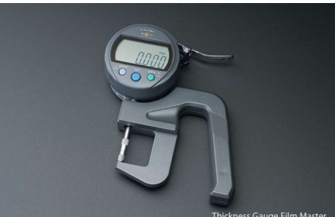
Thickness Gauge Film Master