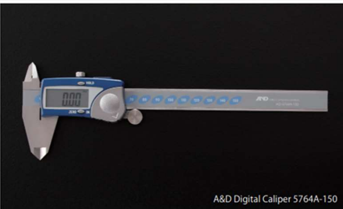
A&D Digital Caliper 5764A-150