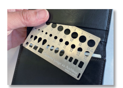
Handy card size, so you can bring it anywhere.